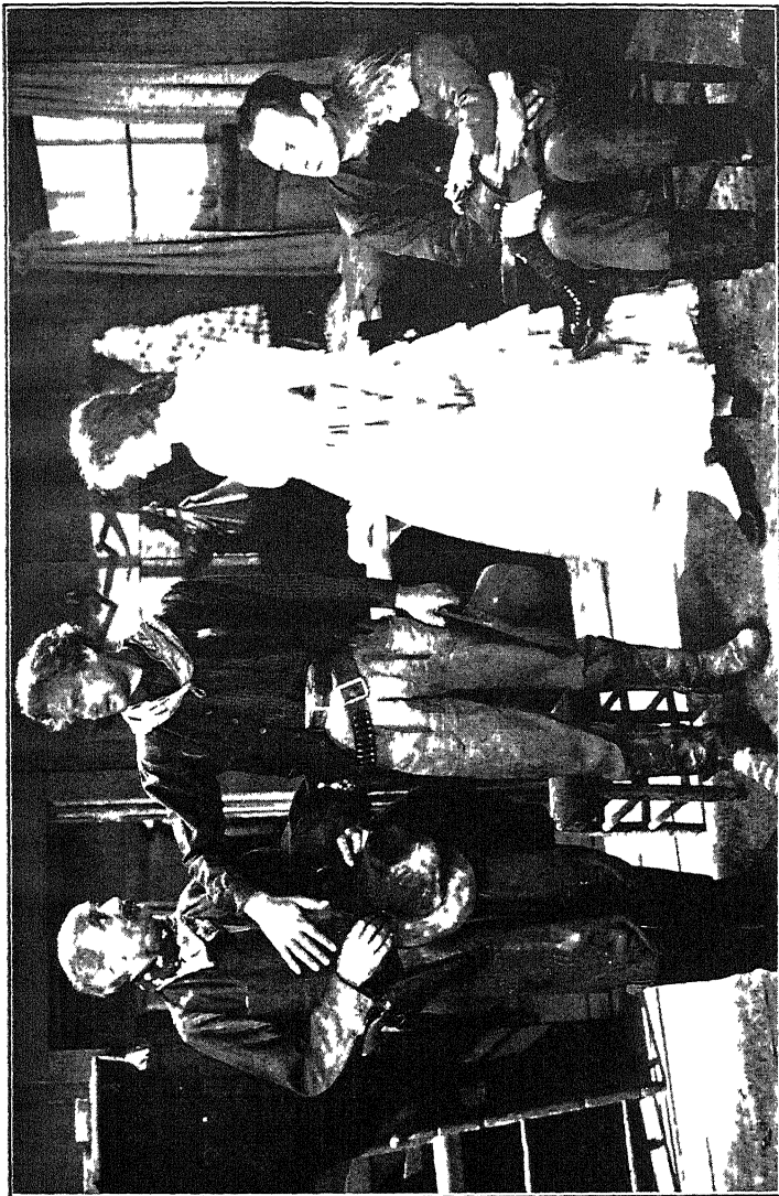
A Metro Goldwyn Mayer Picture LETTY IS FOUGHT OVER BY LIGE AND SOKDOUGH, MUCH TO IRL AMUSLMENT The Hand